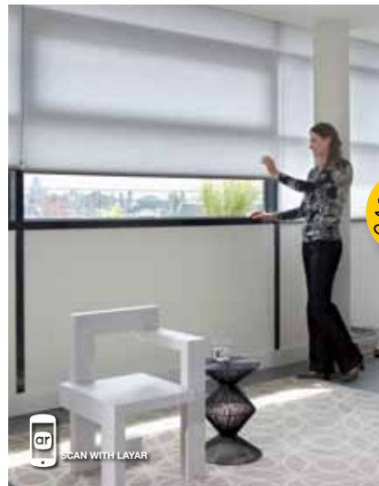
SmartCord® operating system

The LiteRise® operating system is cordless and easy to operate via the bottom rail. You can position it at any height you like.