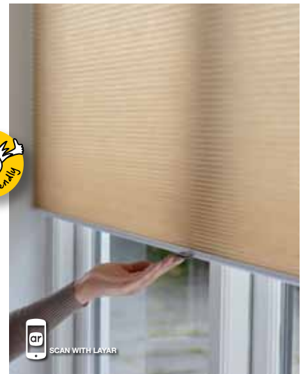
LiteRise® operating system