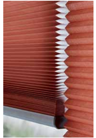
Duette® Shades are perfectly suitable for the office, giving it a warm and stylish look.